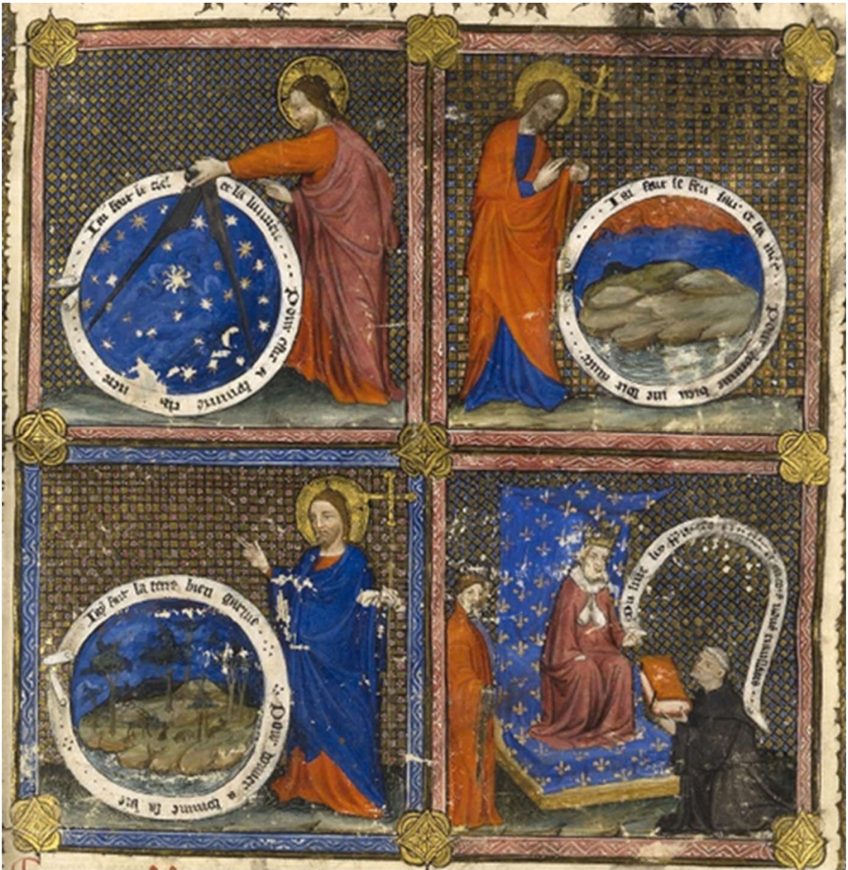
Bartolomeo Anglico: Dio 'artefice' della Natura