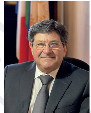
Francesco Mola, Rector of the University of Cagliari

Classrooms, libraries and laboratories are distributed across four main hubs, in downtown, and the university campus of Monserrato, all of them easily accessible through public transport. In addition to the facilities designed for study and training, there are also student dormitories, university cafeterias, sports facilities and reading rooms set in a highly dynamic and culturally lively metropolitan context surrounded by museums, theatres, cinemas, natural parks and breathtaking beaches.