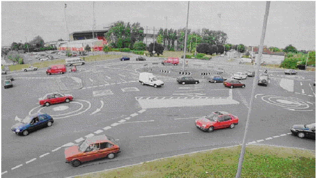
The magic roundabout !