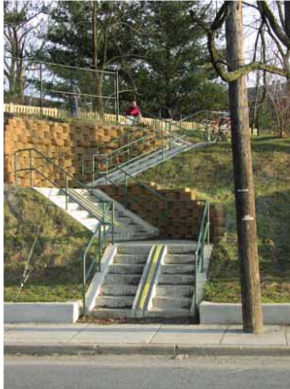
Figure 19-6. Photo. Stairway with bicycle rolling troughs (Capital Crescent Trail, Bethesda, MD).