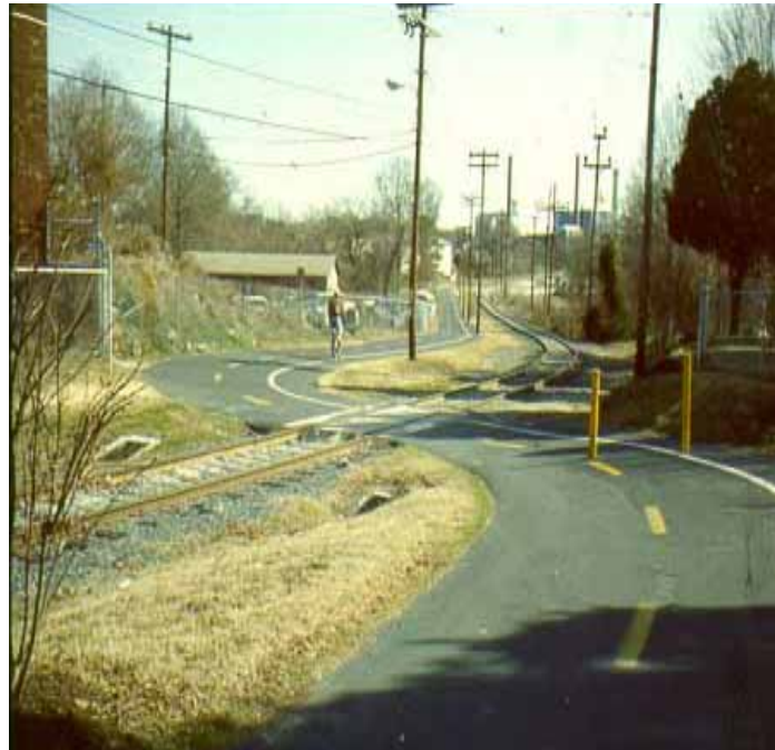
Figure 19-2. Photo. Shared-use paths can be adjacent to railroad lines (Libba Cotton Trail, Carrboro, NC).