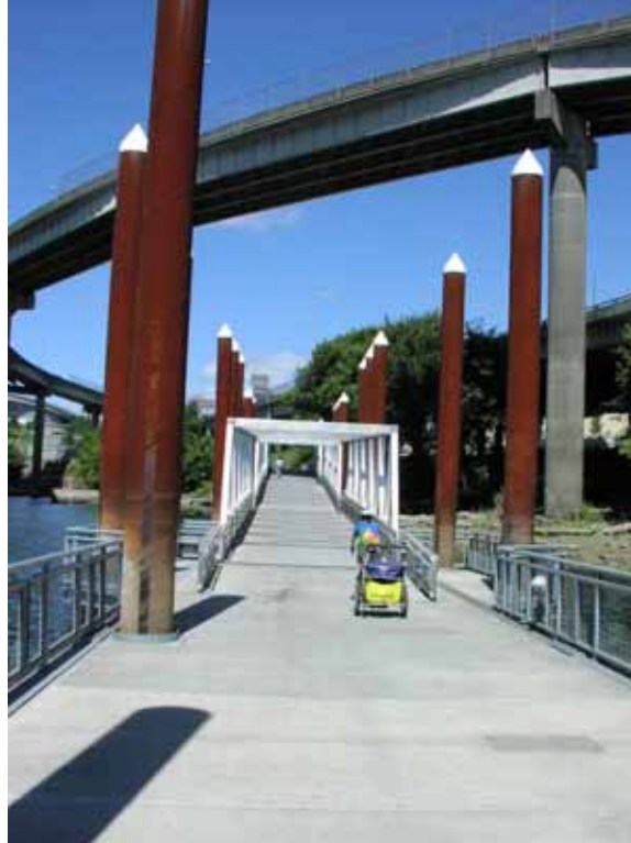
Figure 19-8. Photo. Bridges and floating sections allow paths to cross water and maintain continuity (Eastside Esplanade, Portland, OR).