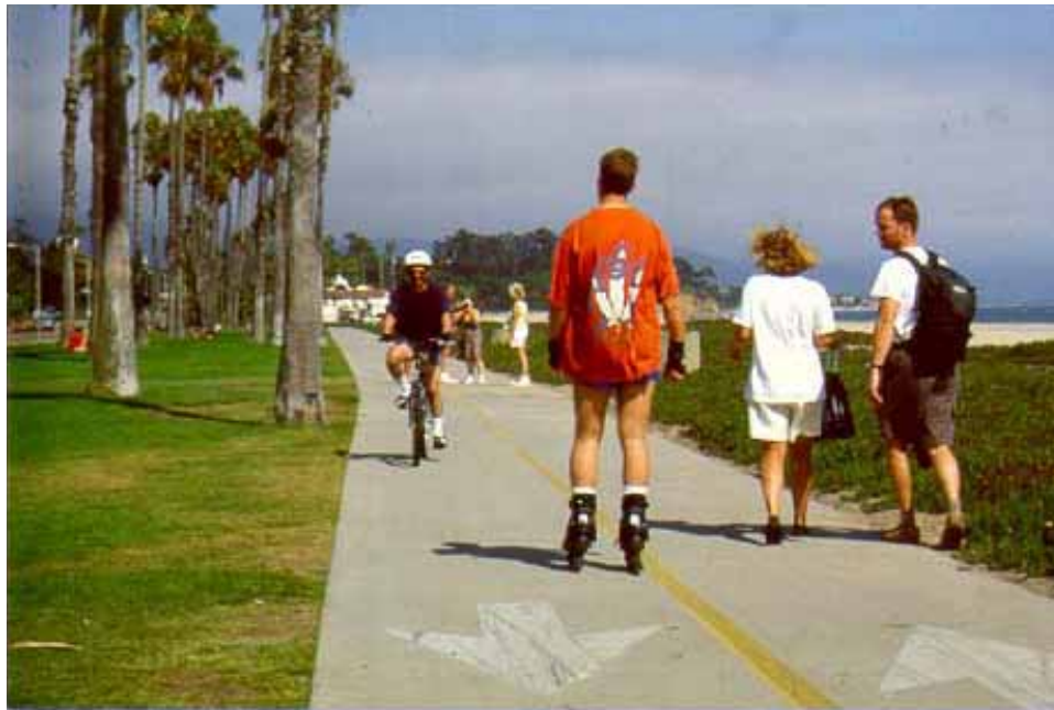
Figure 19-1. Photo. To minimize user conflicts, adequate trail width is critical on paths having high volumes and diverse user mixes (Santa Barbara, CA).

Shared-use paths are typically used by a diverse set of users representing different travel modes, using different types of equipment and traveling at different speeds (see figure 19-1). It is important to understand, even within the basic user categories of bicyclists, pedestrians, and skaters, how diverse path users can be. A recent study, Characteristics of Emerging Road and Trail Users and Their Safety , begins to document the various characteristics of these users and their equipment. (2)