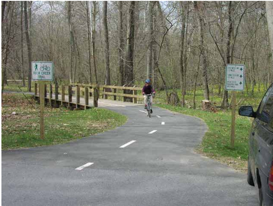
Figure 19-7. Photo. Trailheads with parking and wayfinding signs assist shared-use path users (Rock Creek Trail, Montgomery County, MD).