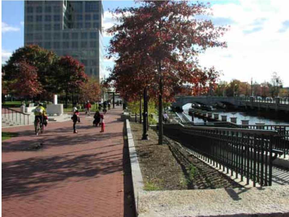
Figure 19-3. Photo. Shared-use paths can be integrated into urban waterfronts and parks, providing direct access to central business districts (East Bay Bicycle Path, Providence, RI).

A wide variety of other facilities are often referred to by the terms path, pathway, or trail. They may share similarities with shared-use paths, but they are not addressed in this course. These include nature and interpretive trails, primitive and backcountry hiking trails, historic trails, heritage trails and touring routes, and walking paths.