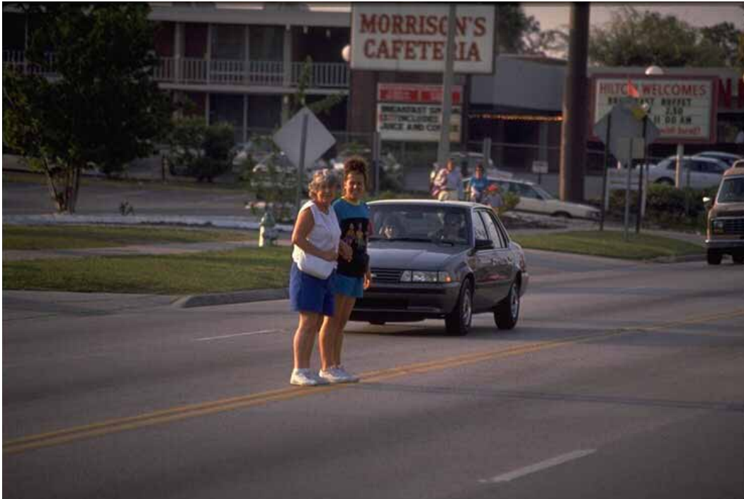
Figure 2-4. Photo. Street crossings can be a significant barrier to walking.

Even with a favorable disposition toward bicycling and walking, reasonable trip distances, and absence of situational constraints, many factors can still encourage or discourage the decision to bicycle or walk. One of the most frequently cited reasons for not bicycling or walking is fear for safety in traffic. (11) Given the prevailing traffic conditions found in many urban and suburban areas—narrow travel lanes, high motor vehicle speeds, congestion, lack of sidewalks, pollution, etc.—many individuals who could meet their transportation needs by bicycling or walking do not, simply because they perceive too great a risk to their safety and health (see figure 2-4).