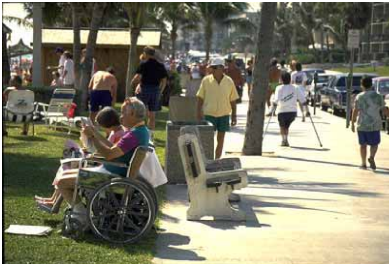
Figure 2-1. Photo. Sidewalks must be designed to serve people of all abilities.