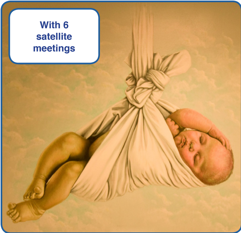
Fresco in the NICU, Neonatal Pathology, Puericulture Institute and Neonatal Section, AOU of Cagliari